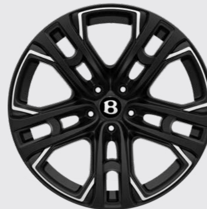
10"x 23" LE MANS

DSP103GB04 DIAMOND CUT ON GLOSS BLACK £2,600.00 + VAT (SET OF 4)