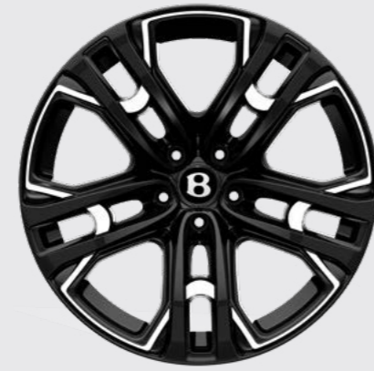
10"x 23" LE MANS

Each wheel is built to accommodate the Bentley centre caps for a complete appearance. Further accentuating the wheels is a new adjustable lowering module that allows customers to create the perfect stance or achieve a responsive ride.