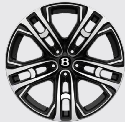
10"x 23" LE MANS

DSP103GB01 DIAMOND CUT ON GLOSS BLACK £2,600.00 + VAT (SET OF 4)